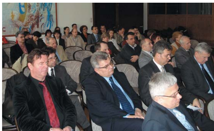
Fig. 1. From the 7th Annual Assembly of the Croatian Cartographic Society

The president proposed the following agenda for 2009: